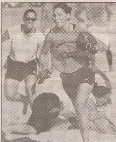
GARY C. KNAPP | SPECIAL TO V-P

Jay DelVecchio created the sport of beach flag football and the Adult Coed Sand Football League as the result of a casual Thanksgiving Day game in 1988. The league is about to kick off its 20th year and take over the beach at 25th Street on Oct. 5.